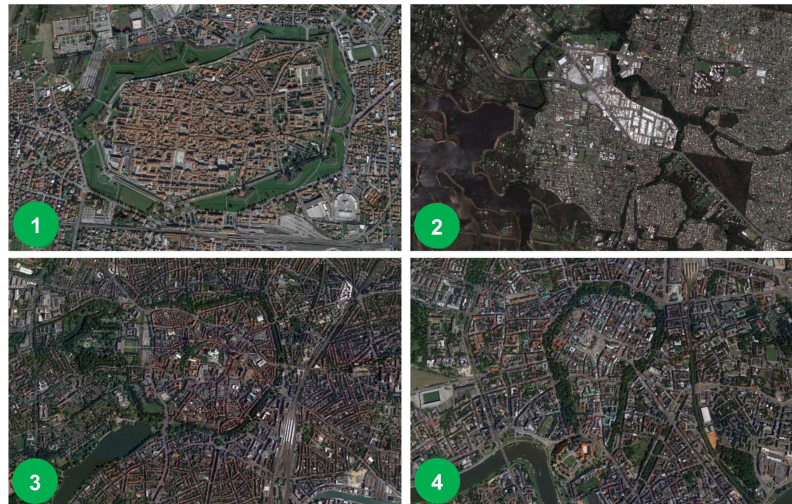
Figure 6. Examples of urban green belt biosphere reserves: (1) Lucca, Italy; (2) Capalaba, Australia; (3) Munster, Germany; (4) Cracow's Old Town, Poland.

Dogse [57] is describing Category 1: Urban green belt biosphere reserve in Figure 4 in which a circular ring around a central urban area is depicted; some example cities include: Lucca, Italy; Capalaba, Australia; Munster, Germany; and Cracow's Old Town, Poland (Figure 6). The remaining three categories in Figure 5 exemplify the varying options researched via UNESCO MAB and illustrate the capacious possibilities of UGS integration and approaches for the design and planning of compact cities.