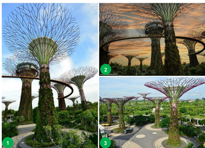
Figure 2. Singapore ‘Gardens by the Bay’: (1) Close up of the ‘Supertree Grove’, (2) Panoramic sunset view of the elevated walkway called OCBC Skyway, (3) Walking environment and scale of the gardens.

UGI and nature-based solutions are terms that are frequently applied interchangeably; they both integrate natural systems with build systems and are often reported as having a key role in achieving a future-oriented compact city framework—both for liveability and sustainability [7,46]. The city of Singapore is often reported as an example of successful biophilic urbanism in which a shift in vision from a ‘garden city’ to a ‘city in a garden’ has slowly been developed over the past few decades [47,48]. An example of this development is the visionary project, with estimated costs of USD 750 million, in and around the Marina Bay Sands area—referred to as the ‘Gardens by the Bay.’ It features extraordinary nature-based systems built with a regenerative design of reclaiming foreshore and natural aesthetic beauty [47]. The project brings to life Singapore’s National Parks Board Service of creating a ‘city in a garden’ approach with iconic features, including the landmark ‘Supertree Grove’ in which tree-like vertical gardens, measuring between 25 and 50 meters tall, have been designed with large canopies that provide shade in the day and come alive with an exhilarating display of light and sound at night (Figure 2) [49].