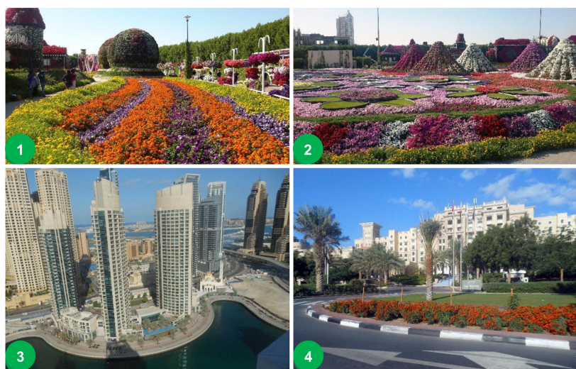
Figure 3. Dubai, UAE: (1) Dubai Miracle Garden with surrounding ‘green’ wall barrier in background, (2) Dubai Miracle Garden with integrated shading structures, (3) Dubai Marina with high-rise buildings and green rooftops, (4) Dubai Streetscape (Photographs taken by A. Russo, 13 November 2015).

a water scarce area, which fronts exceedingly high maintenance costs and irrigation requirements (Figure 3). A policy intervention that considers alternative ecologically oriented design is urgently required in much of the Middle East. One failed example, is a lack of policy for landscape designers in utilising native plant species [52]. To our knowledge, Abu Dhabi, UAE, is the only major Middle Eastern city focussing on such regulations by way of its innovative green standards. Its design methodology, named ‘Estidama,’ the Arabic word for sustainability, constructs and operates buildings and communities by imposing building codes that are green-friendly, while still recognising its unique regional needs and expansive demands [53].