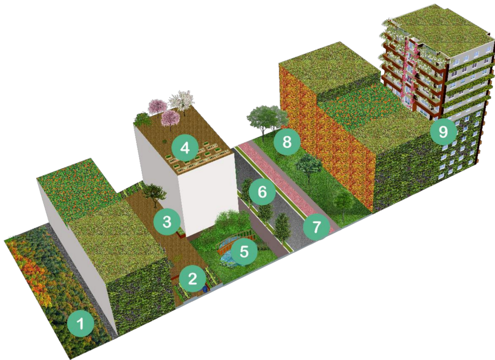
Figure 4. Landscape architectural designs and features of compact cities, promoting ecosystem services, biodiversity, mental health and wellbeing, include: (1) urban forest/urban parks, (2) allotment gardens, (3) vegetable raingardens, (4) edible green roofs, (5) detention and retention ponds/wildlife ponds, (6) street trees, (7) bioswales, (8) domestic/rain gardens, (9) building integrated vegetation (e.g., biodiverse green roofs, green walls and climbing plants).

the natural, socioeconomic and cultural environments are shaped by urban influences and pressures and set up and managed to mitigate these pressures for improved urban and regional sustainability”.